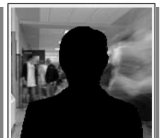
Will You Be The One? Committed to Christ