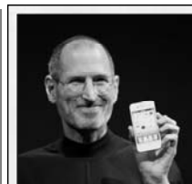
Steve Jobs Apple CEO, inventor of iPhone