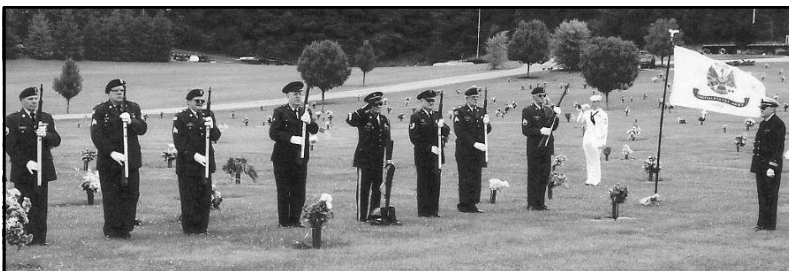
Members of the American Legion Post #3110, Oak Hill, WV